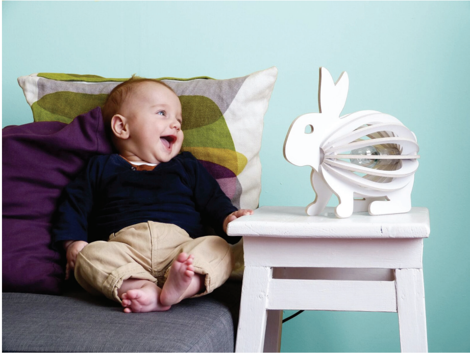
Gone's (France), young French brand, founded in 2013 by the passion of the brothers Hadrien and Marian Dumontet, present a selection of animal shaped lamps (bird, cat and rabbit): Zooo Lamps in natural wood with a clean and simple design. #DontStopReading