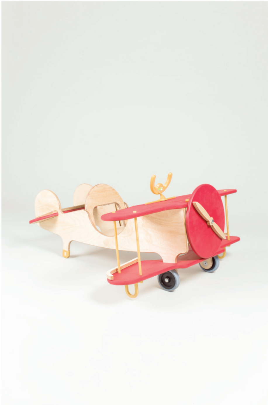
Kids'Garret (Germany), handmade project founded in Berlin by an Italian couple – he is an architect, she is a costume designer. Designed for children from 3 to 7 years old. Several collections that tell stories inspired by historical characters. Preview of the first collection titled Amelia and dedicated to Amelia Earhart, one of the first aviatrix women: a table-airplane Serious Desk, a Flight suit and a Goggle hat. #DontStopFlying