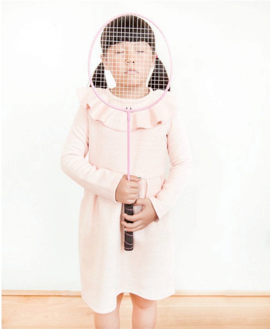
MioMio (Italy), new Italian brand with an important sartorial history behind, creates a tailor made cotton and hemp collection with clean and poetic lines. On display are some models for girls (12 months – 8 years old) coupled with those of their dolls, #DontStopPlaying