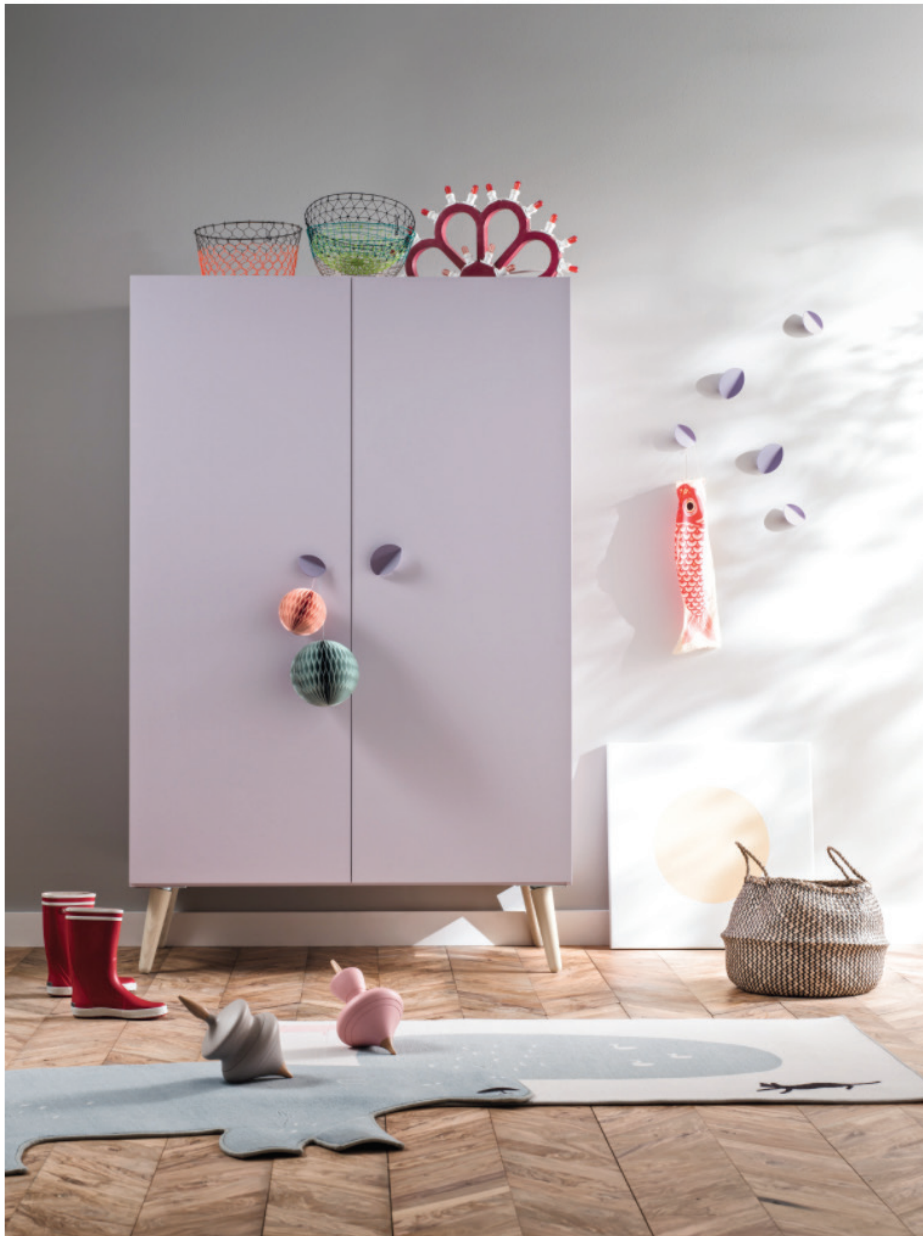
Nidi (Italy), Italian brand that designs spaces for children and young people. Presenting furniture and accessories that give rhythm and character by creating personal environments. Woody wardrobe, Noel and Elio pouf, Tak chair, Mushroom and Apple carpets, and Surfy bookcase from the new collection Teens. #DontStopGrowing #DontStopSittingDown