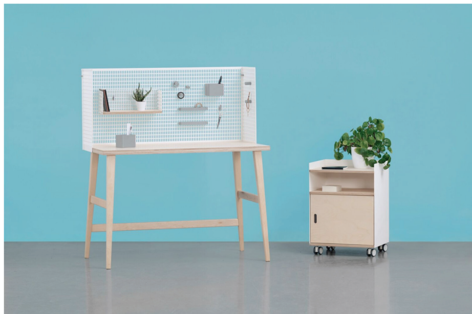
Fam Fara (Poland), Polish company with a linear and functional design, presents Kubbiki, natural wood 50x50 modules to stack and pull on each others to play and design the space, and their baby chair Krzeslo. Preview in Milan for LAD desk and container. #DontStopDrawing #DontStopSittingDown