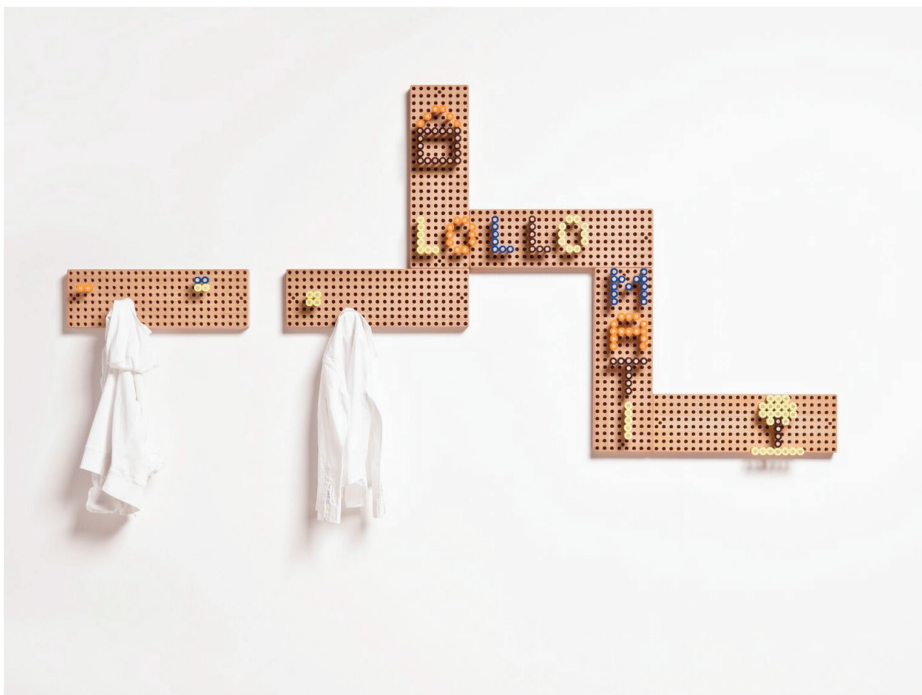
Babau Lab (Italy), ethical lab careful to the use of natural and recyclable materials, presents 25x8: wooden toy for children which gives free rein to the imagination. All strictly "Made in Italy". #DontStopPlaying