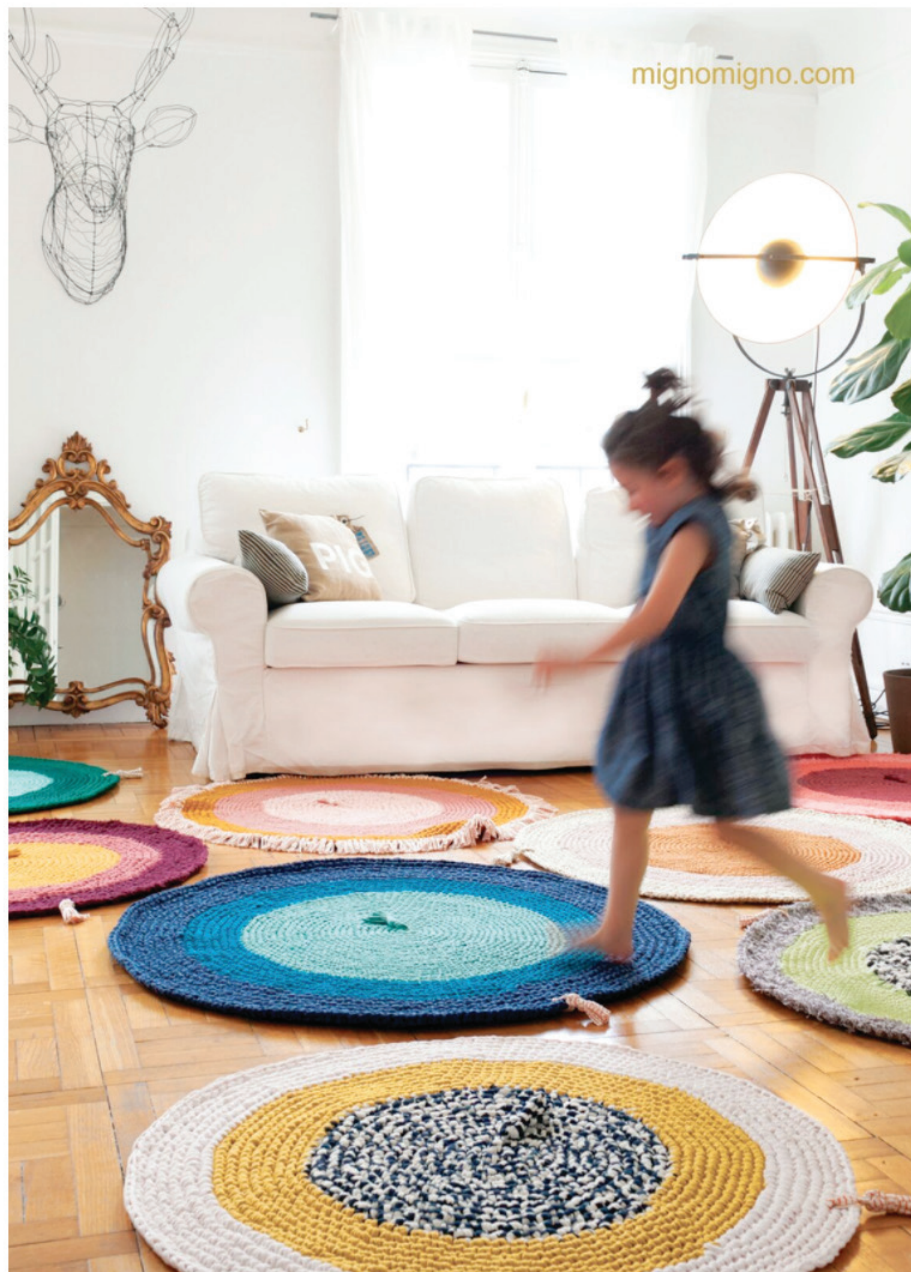
Mignomigno (Italy), Italian brand in Paris, presents an entirely handmade carpet realized with high quality recycled cotton. Each piece is unique, numbered and the choice and combination of colors is developed with great care. #DontStopPlaying