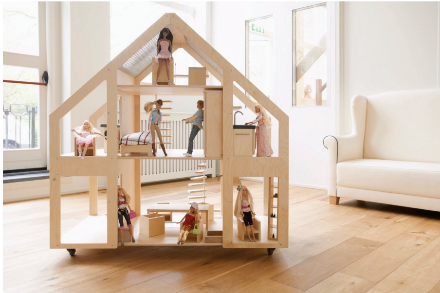
DollsVilla Global (Netherlands), Dutch brand run by Liliane Limpens, designer of the DollsVilla by Liliane. The child height DollsVilla is a sustainable dollhouse on wheels for children's most cherished 1:6 cars and dolls of 30 centimetres. With a cool design interior, stainless steel roof plates, a car ramp and three trays. #DontStopHousing