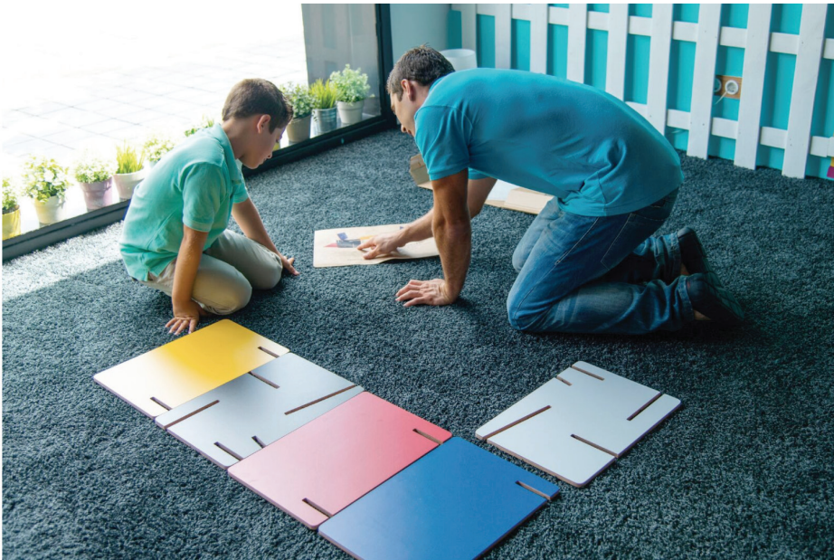
Unamo Design (Spain), Spanish brand from Valencia, presents the Essenzia kid chair. Made from 5 colored Formica pieces (red, blue, yellow, white and black) with a connection to Mondrian and the Bauhaus. Convertible into a desk. #DontStopSittingDown